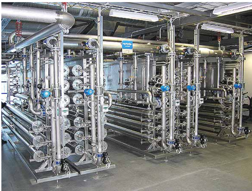
Figure 1. Kuivala RO plant