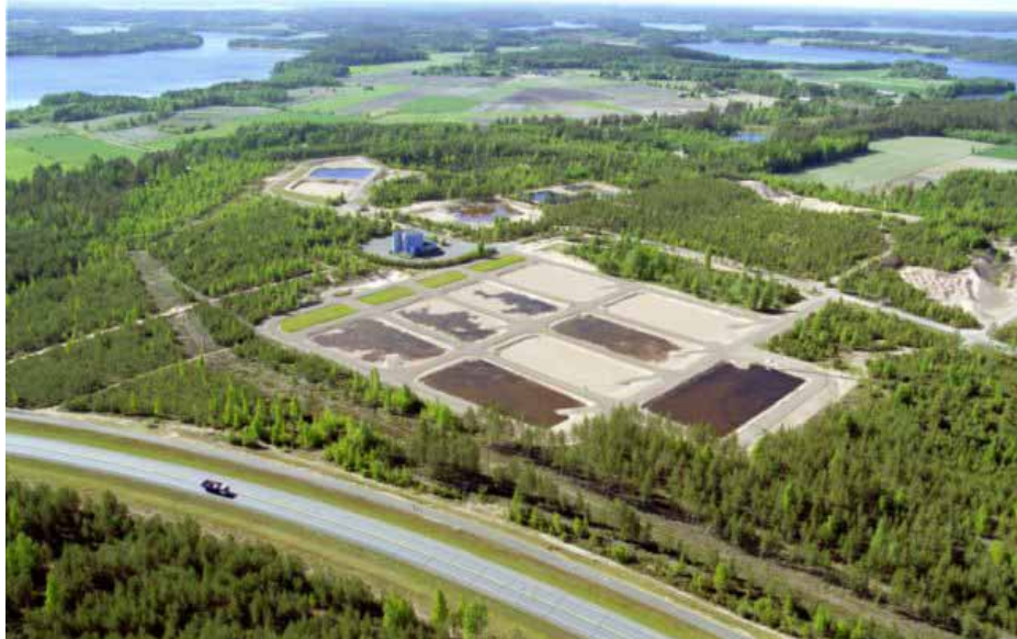
An aerial view of the Kuivala water treatment plant in southern Finland. The plant uses FILMTEC™ XLE reverse osmosis membranes to remove fluoride from drinking water.