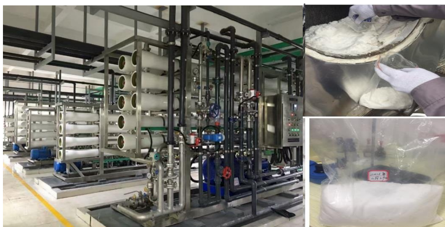
Figure. Nanofiltration / reverse osmosis system and crystalized salt photo