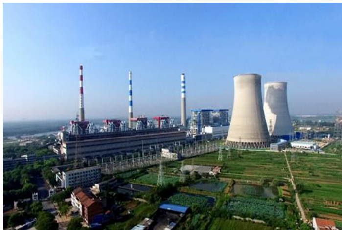
Figure. The bird view of Guodian Hanchuan power plant

Beijing Lucency enviro-tech Co. Ltd, Nanjing branch (Simplified as Nanjing Lucency in the following parts) is a subsidiary of Guodian Technology & Environment Corporation. Nanjing Lucency has investigation & engineering design, construction, and operation capability in the water treatment technology as well as its extended value chain. To date, Nanjing Lucency has completed more than 200 projects in the power plant supply water treatment and industrial wastewater treatment.