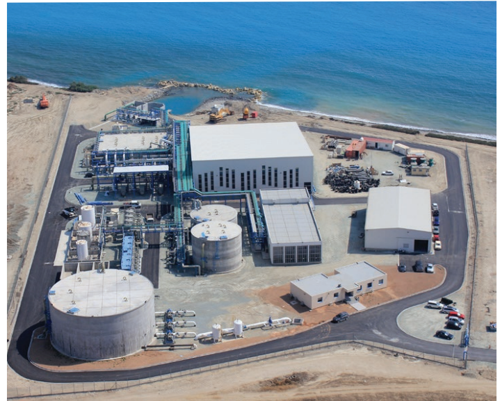
Air view photograph of Limassol Desalination plant.

*Blended product water after Boron Selective Resin and Reverse Osmosis System*