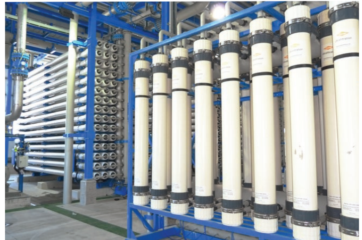
Photograph of a UF and RO train from Limassol Desalination plant.