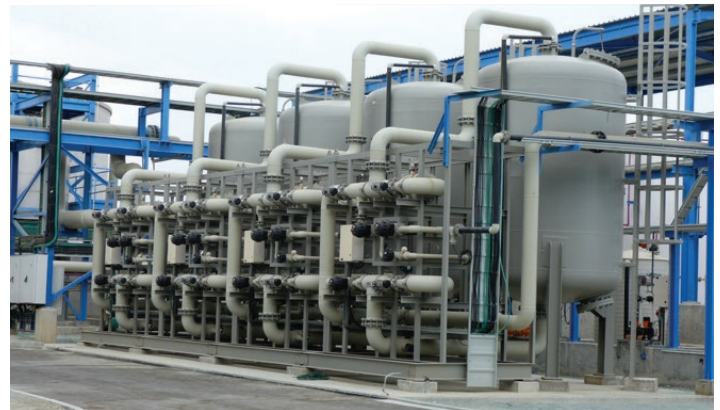
Photograph of the Boron Selective Resin system.

An Ion exchange resins system is installed to further polish the rear permeate stream from the RO system enhancing the boron removal of the system. The system will contain 54 m 3 of AmberLite™ PWA10 and will treat a flow between 12,000 – 25,000 m 3 /day (depending on the water temperature). AmberLite™ PWA10 resin features very high selectivity for boron and low risk of interference with other salts which makes it highly suitable for removal of boron from RO permeate water.