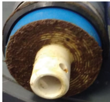
Without B-Free™ Pre-treatment