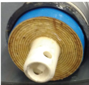
With B-Free™ Pre-treatment