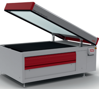
DuPont™ Cyrel® EVO 2000 ECLF