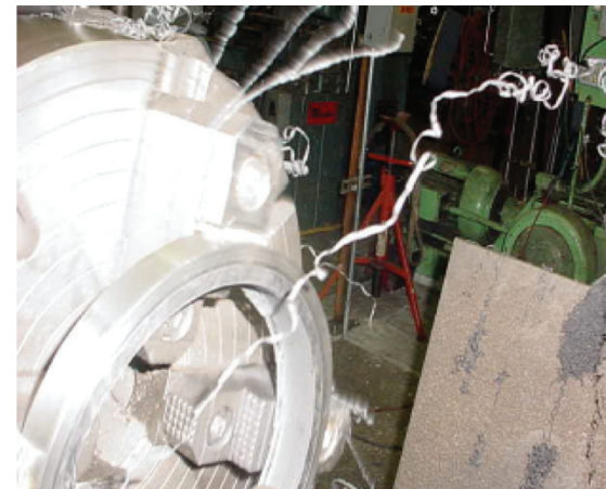
Vespel® CR-6100 is fast and easy to machine.

Phone: 800-222-VESP (8377) Fax: 302-999-2311 E-mail: web-inquiries.DDF@usa.dupont.com Web: vespel.dupont.com pumps.vespel.dupont.com