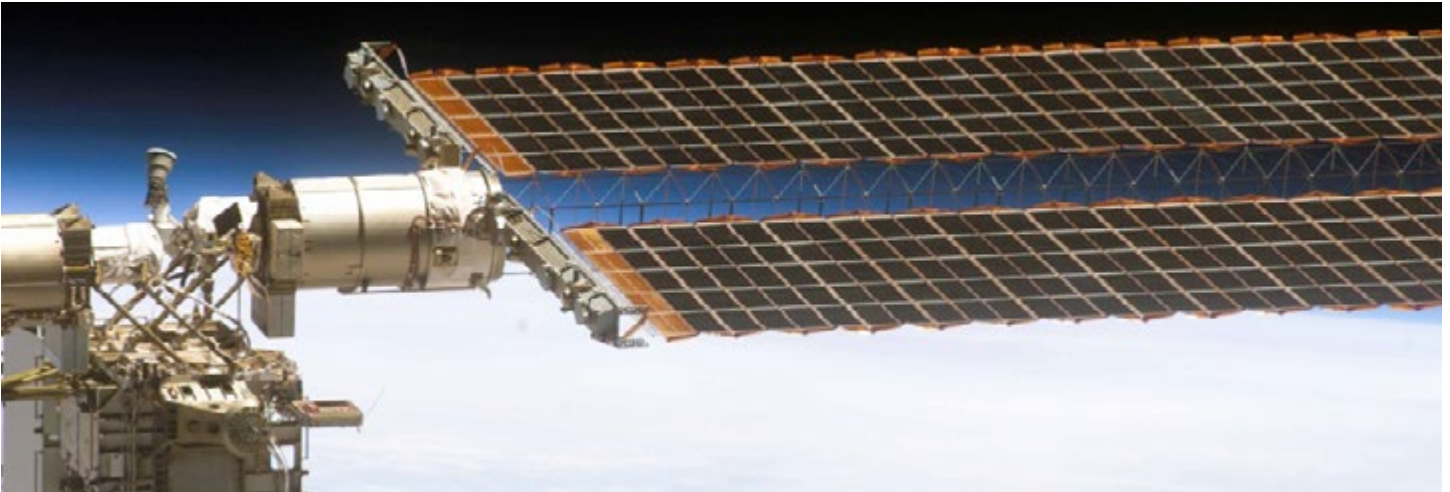
Flat flexible cables made with Pyralux® can be folded or even crumpled without affecting performance, and can be anywhere from a few feet to over 100 feet long.

Electrically insulating films/laminates and adhesive thermal tapes offer excellent thermal conductivity, lower thermal resistance, higher heat dissipation and improved thermal stability during continuous operation.